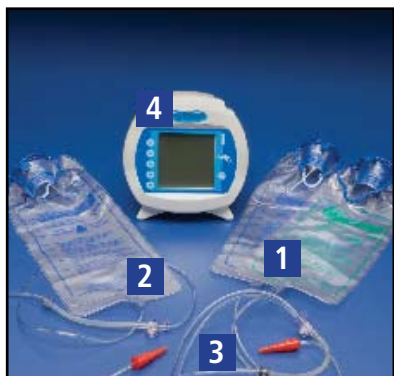
1) Flead & flush valve assembly, 2) Feed only valve assembly, 3) Distal end of feeding set, 4) Pump