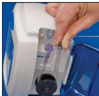
2) Grasp black ring retainer, gently wrap tubing around rotor, and insert retainer directly into right pocket. Do not overstretch tubing.