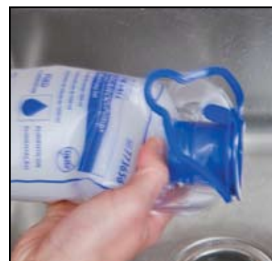
4) Fill the feed bag with water to approximately half of the total capacity. Properly seal the bag and shake for 5 to 10 seconds.