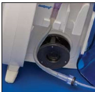
2) CAUTION- if set is removed from the pump, it may damage the set and prevent use and will negatively effect the system accuracy.