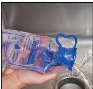
9) Empty bag of water. Prime to remove any remaining water out of the feeding set.