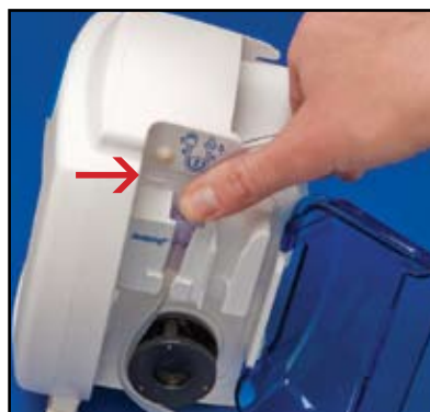
1) Grasp thumb tab on valve and insert firmly into left pocket, ensure valve is fully seated. Tab should align with raised white line on left.