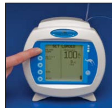
7) Press the "Prime Pump" button to enter the "Prime Pump" screen.