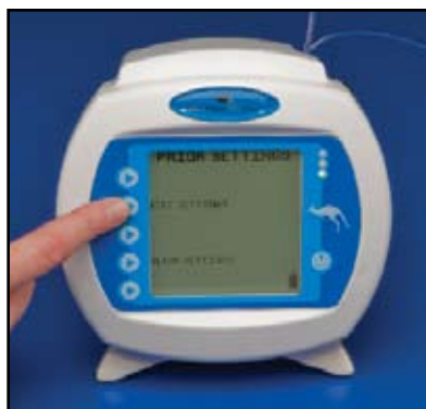
6) Power the pump on. Select "Keep Settings" to continue with previous setting or "Clear Settings" to start with programming new pump settings.