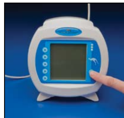
3) To properly unload a pump set, power the pump off and wait 10 seconds before removing the feeding set.