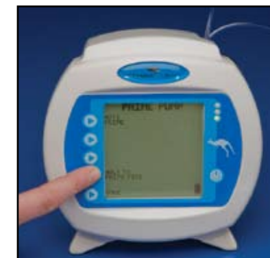
8) Press and hold the "Hold to Prime" button until only clean water flows through the tubing. Once the rotor starts, this takes between 1 and 2 minutes.