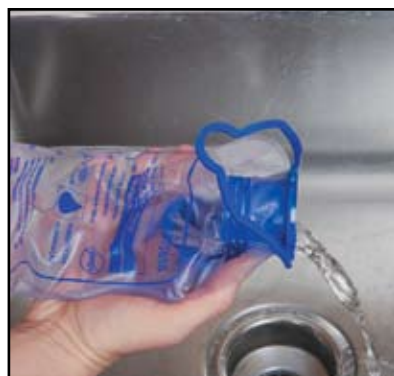
5) Empty the feed bag and repeat the last step until the bag contains clean water.