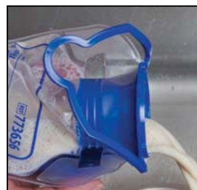
3) Empty contents of feeding bag.